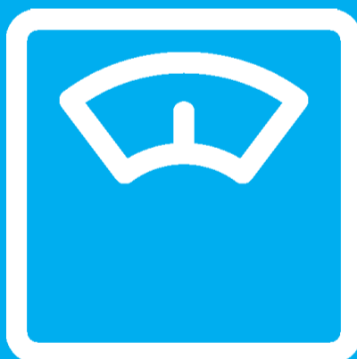
UNEXPLAINED WEIGHT/APPETITE LOSS