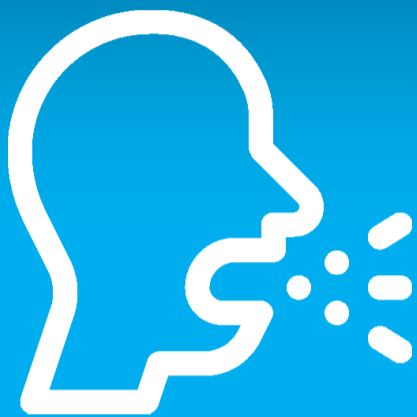
A PERSISTENT COUGH