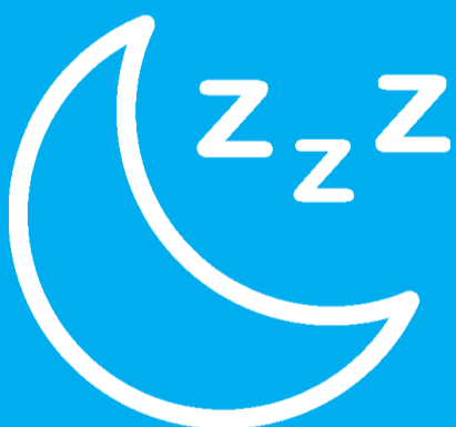
UNEXPLAINED TIREDNESS, OR LACK OF ENERGY