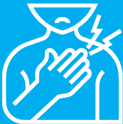
CHEST AND/OR SHOULDER PAIN