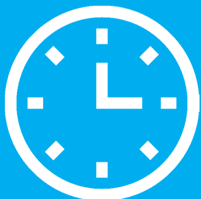
CHANGE IN LONG-TERM COUGH, OR A COUGH THAT GETS WORSE

IF YOU ARE EXPERIENCING ANY OF THESE SYMPTOMS, GO TO YOUR DOCTOR.