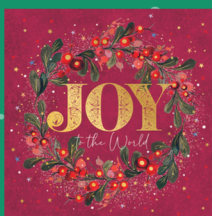
Joy to the World Wreath