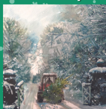
Christmas Tree Delivery