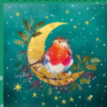
Robin in the Crescent Moon