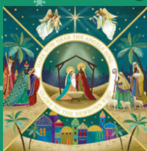
Glory to the New Born King