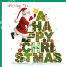
Santa Placing the Star