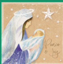
Madonna and Child Peace